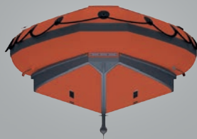
ALUMINIUM HULL Sturdy and durable