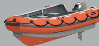
COMPACT LIGHT WEIGHT DESIGN Optimum davit integration