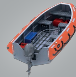
D-SHAPE INFLATABLE TUBE Stability and deck space