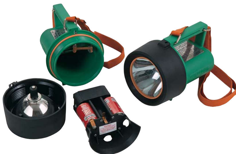
WolfLite H-4DC 2.4w spot beam (approx 3°) Peak luminous intensity at 5m 800lux