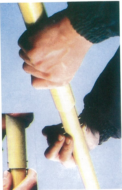
图 2 打开包装筒或包装袋，取出角反射器和支柱（由2~3根杆子组成）。连接两杆（救生艇用）或三杆（救生筏用），使连接弹簧销卡牢。

Fig.2. Open the packing barrel or packing bag. Take out the angle reflector and supporting poles. Connecting the poles and make joint spring pins locked.